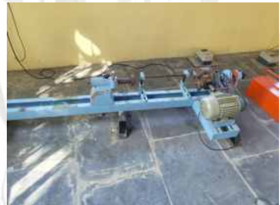
Bamboo turning machine with chuck 1 ho