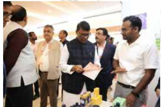
Inauguration Odisha Bamboo Haat Website