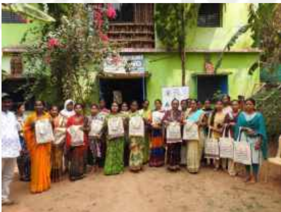
Artisan Training at Sudurkumpa, Phulbani in Khandamal District