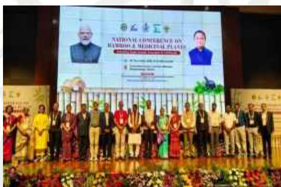
National Conference on Bamboo, Nov 2025

"A convergence of national expertise—building a shared vision for bamboo's future in India."