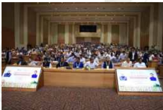
Participants of National conference on Bamboo and medicinal plants