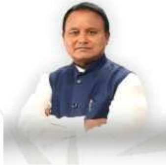
Shri Mohan Charan Majhi Hon'ble Chief Minister