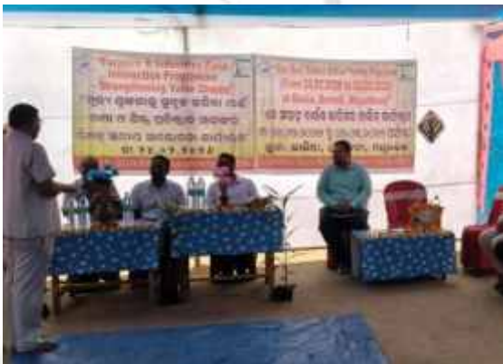
Field Interaction, Bhalia, Mayurbhanj

The initiative was anchored on the theme of “ Strengthening Value Chains ”, with an emphasis on transforming farmers from mere suppliers of raw material into active participants in value addition and enterprise development. Industry representatives shared valuable insights on product specifications, quality standards, and pricing mechanisms, thereby equipping farmers with practical market intelligence and enhancing their capacity to engage with formal markets.