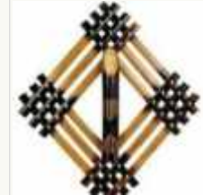
Bamboo Decorative Flower Hanger NIS/019/2025