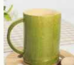
Bamboo Cup NIS/025/2025