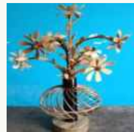
Bamboo Flower Stand