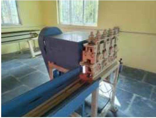
Heavy Duty Sliver Machine - 8 Roller, 2HP