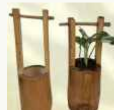
Money Plant Hanger NIS/016/2025