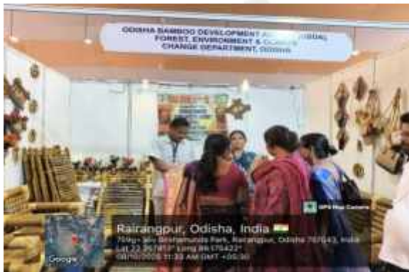
Viksit Odisha Exhibition, Rairangpur 2025

Participation in these prominent platforms enabled OBDA to exhibit the rich diversity and craftsmanship of Odisha's bamboo products, facilitate engagement with national markets, and strengthen the State's positioning as an emerging hub for bamboo-based enterprises and value-added products.