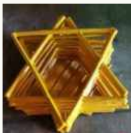
Bamboo Storage Decorative