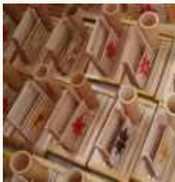
Office Pen Stand