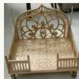
Bamboo Decorative Mandir/ Pooja Chowki