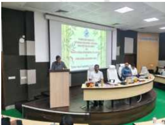
Stakeholder Meet- 16 July 2025, Bhubaneswar

The workshop collectively contributed to outlining a strategic roadmap for the development and scaling up of the bamboo sector in the State.