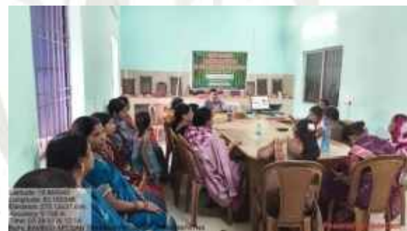
Artisan Training Programme at Santhapur, Dhenkanal