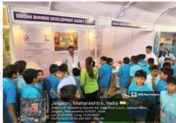
Pragatishila Maharashtra, Jalagaon 2025