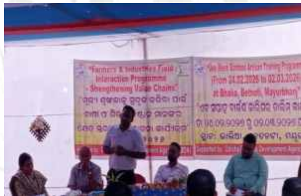
Farmers & industries engagement