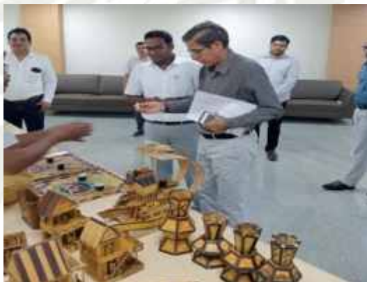
Inspection Bamboo Handicraft Item PCCF & HoFF, Odisha