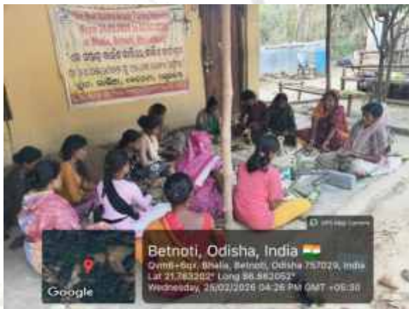
Artisan training — Mayurbhanj

The training covered product design, finishing techniques, tooling, safety, and market orientation. By bringing the training to the doorstep of artisan communities, OBDA ensured maximum outreach and impact.