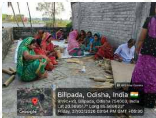
Bamboo artisan skill development training at Bilipada, Banki