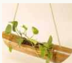
Money Plant Hanger NIS/023/2025