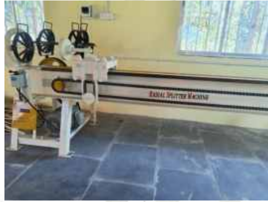
Radial Splitter Machine 8ft