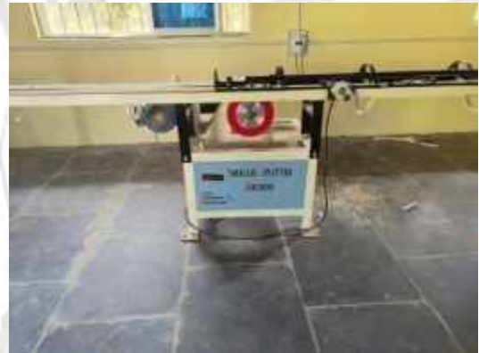
Bamboo Crosscut Machine