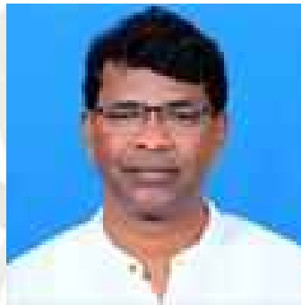
Shri Ganesh Ram Singhkhuntia Hon'ble Minister Forest, Environment & Climate Change Dept., Govt. of Odisha