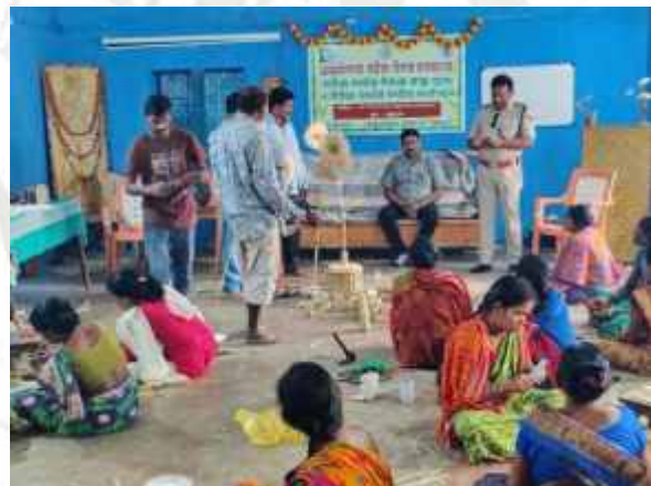
Hands-on bamboo craft session at sudurkumpa , Phulbani