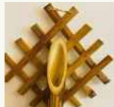
Flower Show Hanger NIS/015/2025