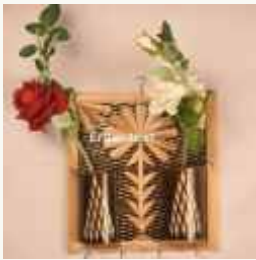
Bamboo Flower Hanger