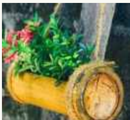
Decorative Plant Hanger NIS/017/2025