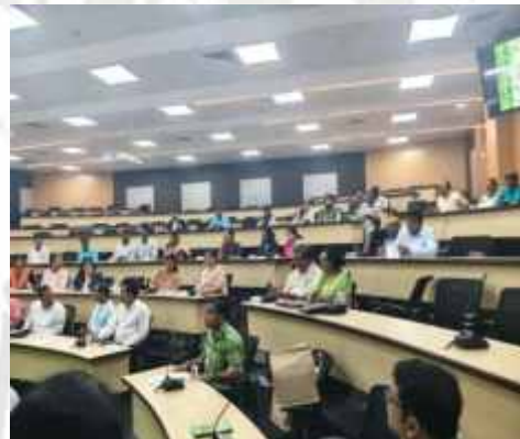
Participants at Aranya Bhawan