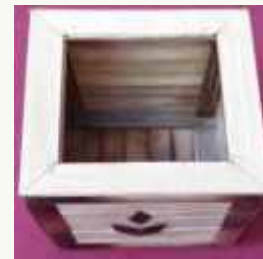
Bamboo Pen Stand