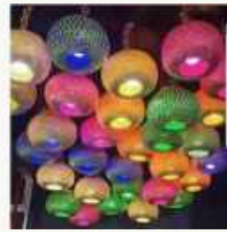
Show Hanging Light