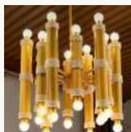
Bamboo Decorative Light