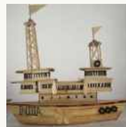
Bamboo Ship Craft