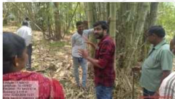
Artisans at URUVU, Wayanad, Kerala — March 2026