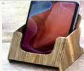
Bamboo Cell Phone Stand