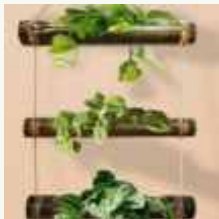
Money Plant Hanger NIS/014/2025

New India cluster from Santhapur offers an impressive variety of bamboo lifestyle products — from elegant plant hangers and decorative items to practical everyday products like bamboo cups, trays, mirrors, pen stands, and storage products.