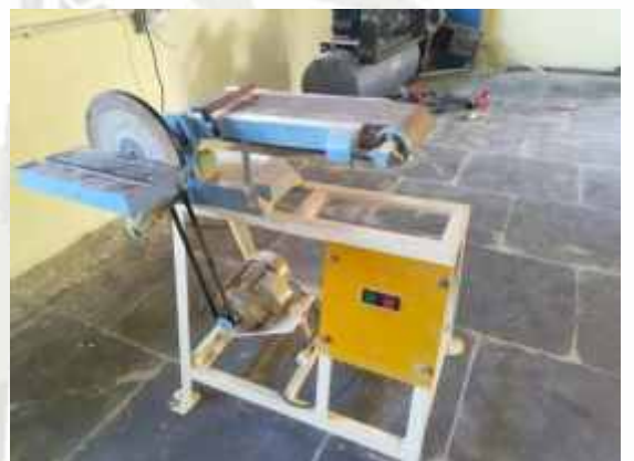
Belt & disc sander 1HP machine