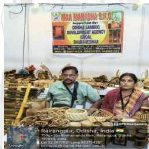
Viksit Odisha Exhibition, Rairangpur 2025