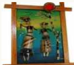
Bamboo Craft Decorative Item NIS/024/2025