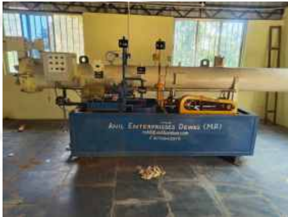
Vacuum pressure impregnation machine