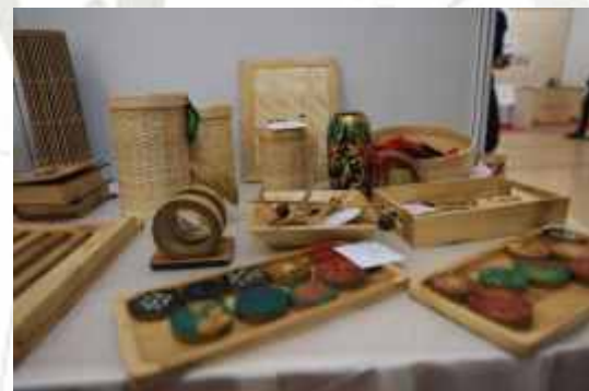
Fine finished products of URAVU