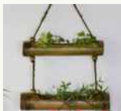
Money Plant Decorative Hanger NIS/020/2025