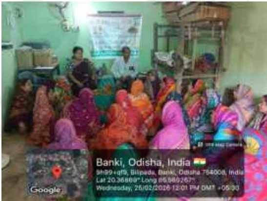
Bamboo artisan skill development training at Bilipada, Banki