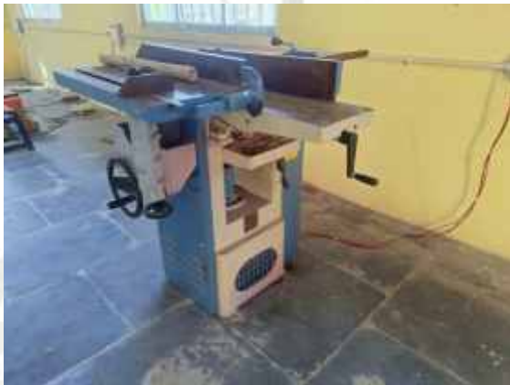
Universal bamboo working machine 3HP