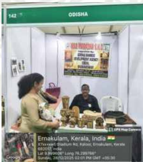
Exhibition stall at Ernakulam Kerala, Odisha bamboo products