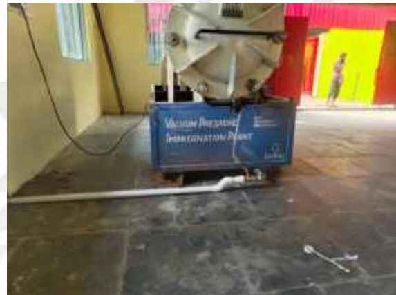
Vacuum pressure Machine