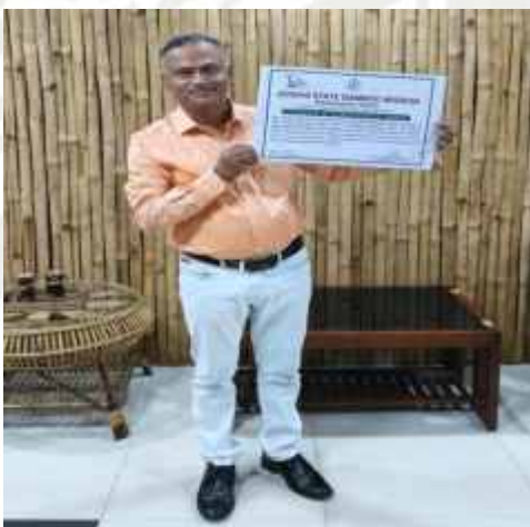
SLBNAC Accreditation Committee Meeting Ceremony