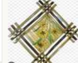
Wall Show Decorative Item NIS/022/2025