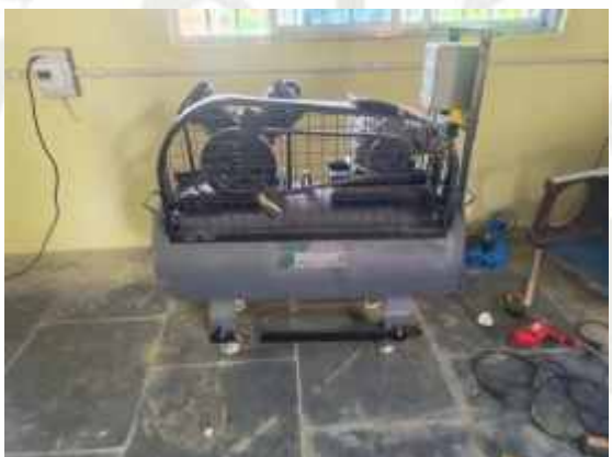
Spray Gun with compressor machine