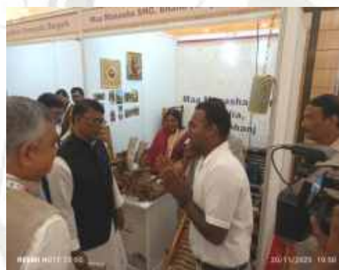
Delegates at Lok Seva Bhawan