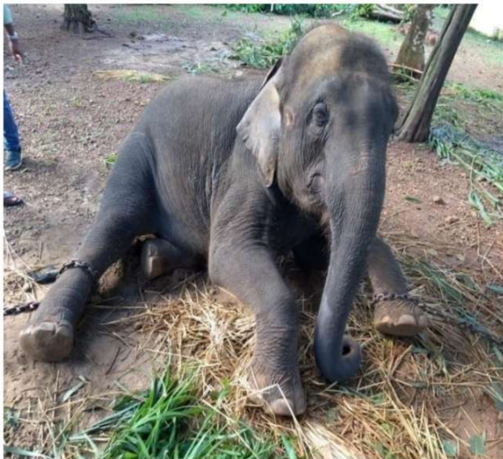
Fig.1. Lethargy and sternal recumbency

The prevalence of EEHV in captive Asian elephants in North America and Europe has been well documented. In India, the incidence of EEHV-HD was first reported in 1997. 9 of 15 potential cases were confirmed from Southern India in wild free-ranging calves in Kerala, Karnataka, Tamil Nadu forest reserves, and Madras Zoo (Zhacharia et al , 2013). A positive case of EEHV1A infection has also been reported from captive Asiatic elephants of Assam (Barman et al , 2017). Within the last 10 years, 59 fatal cases of EEHV disease in Asian elephants have been identified within the eight range countries. Twelve of these deaths were wild elephants (Luz and Howard, 2016).