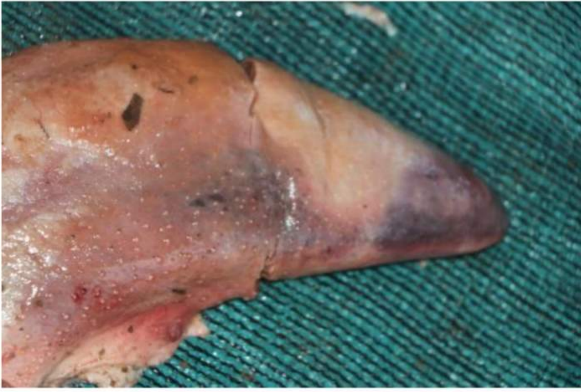
Fig.7. Haemorrhage in tongue