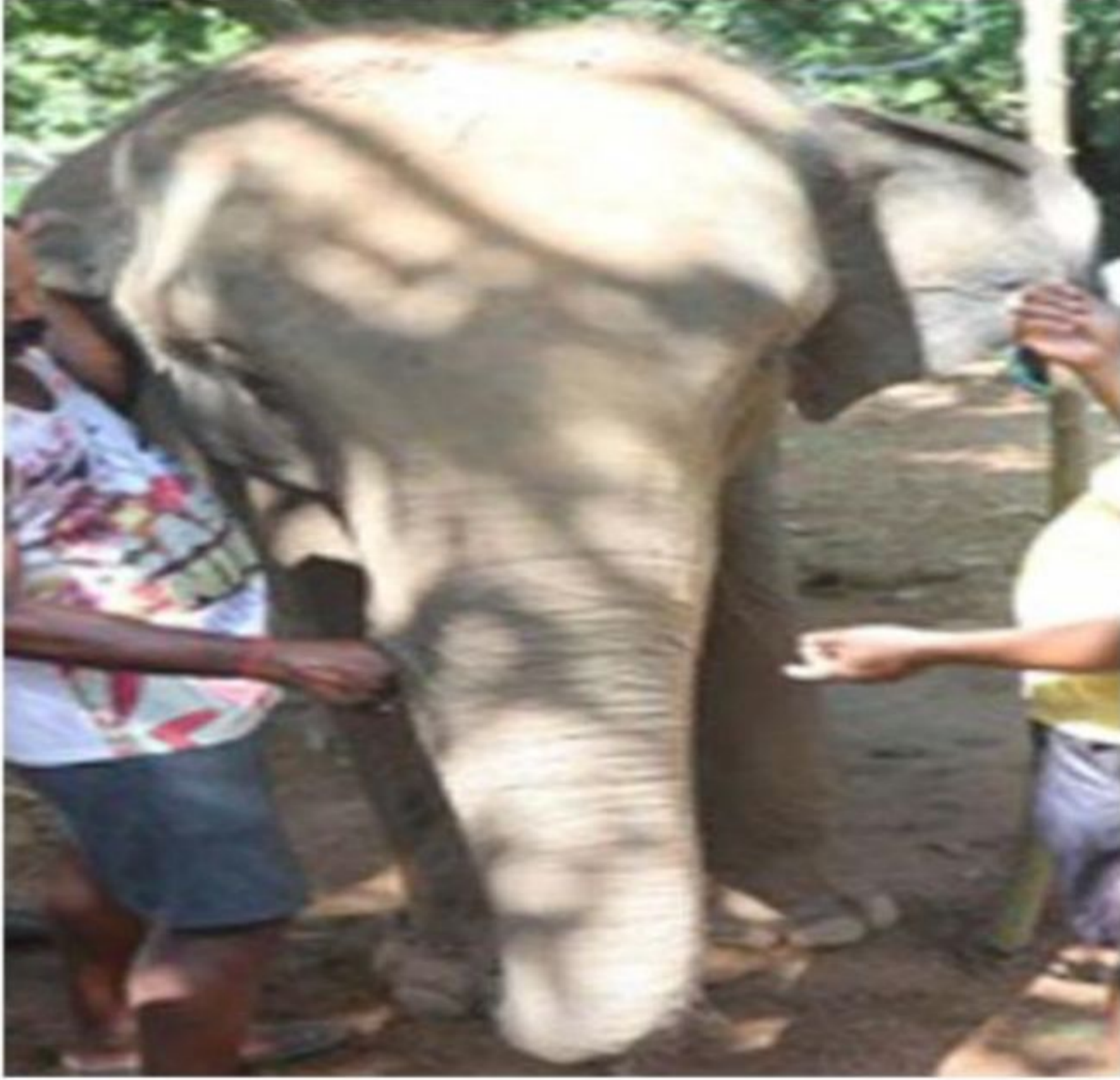
Fig.3. Edematous swelling of the trunk