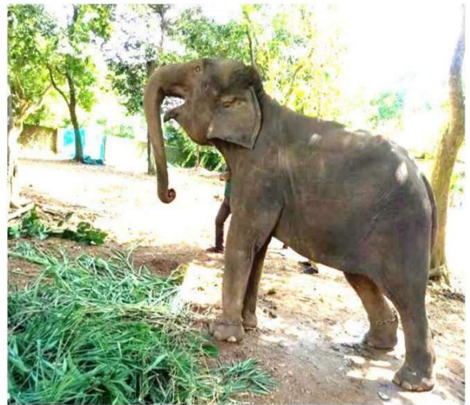
Fig.2. Open mouth breathing