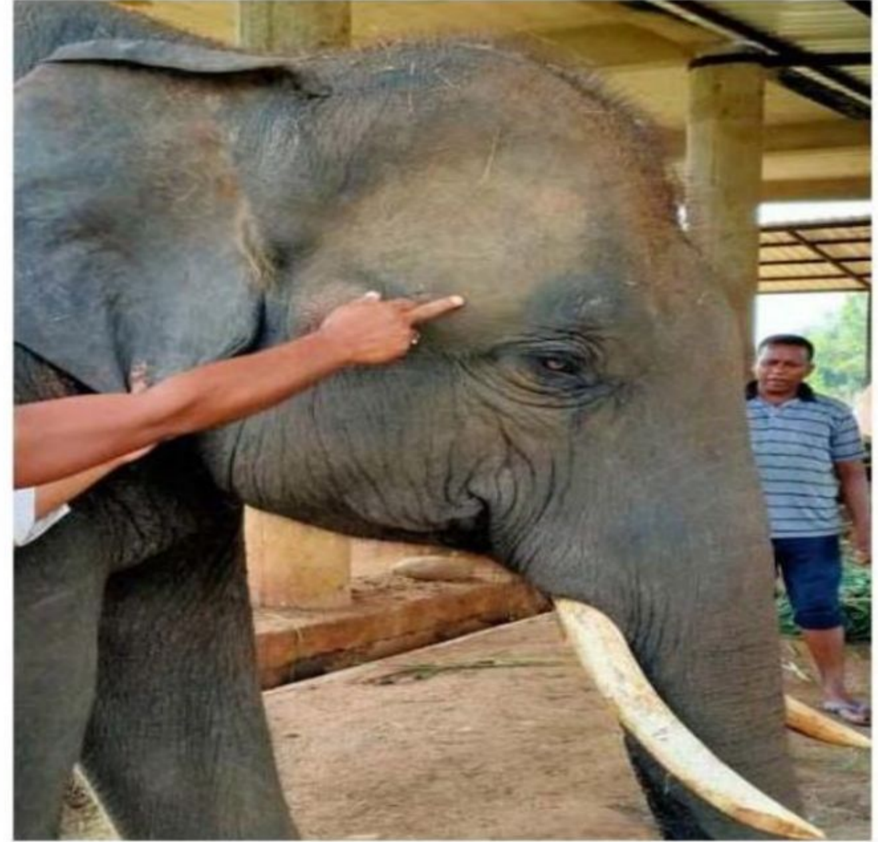
Fig.4. Edematous swelling of the temporal region