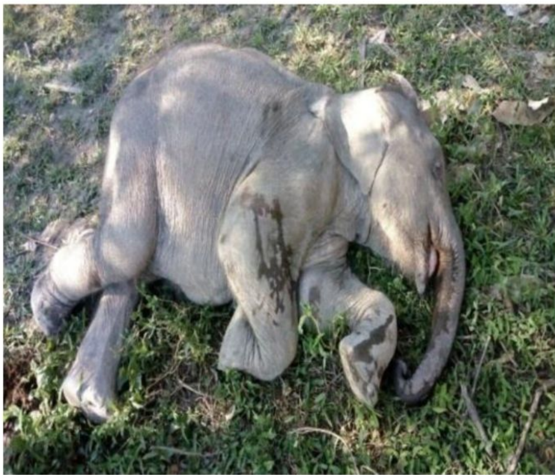
Fig.5. Lateral recumbency