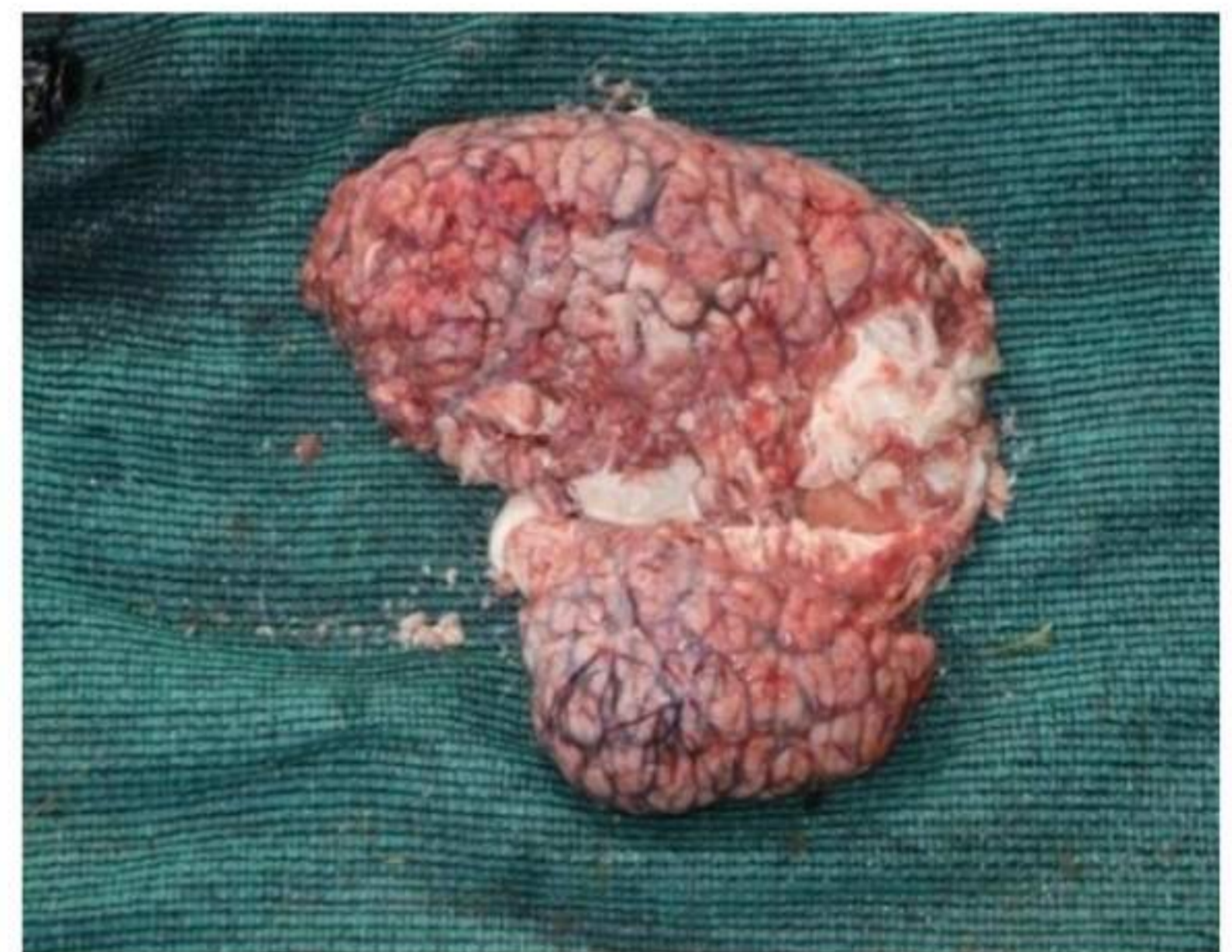
Fig.11. Haemorrhage in brain