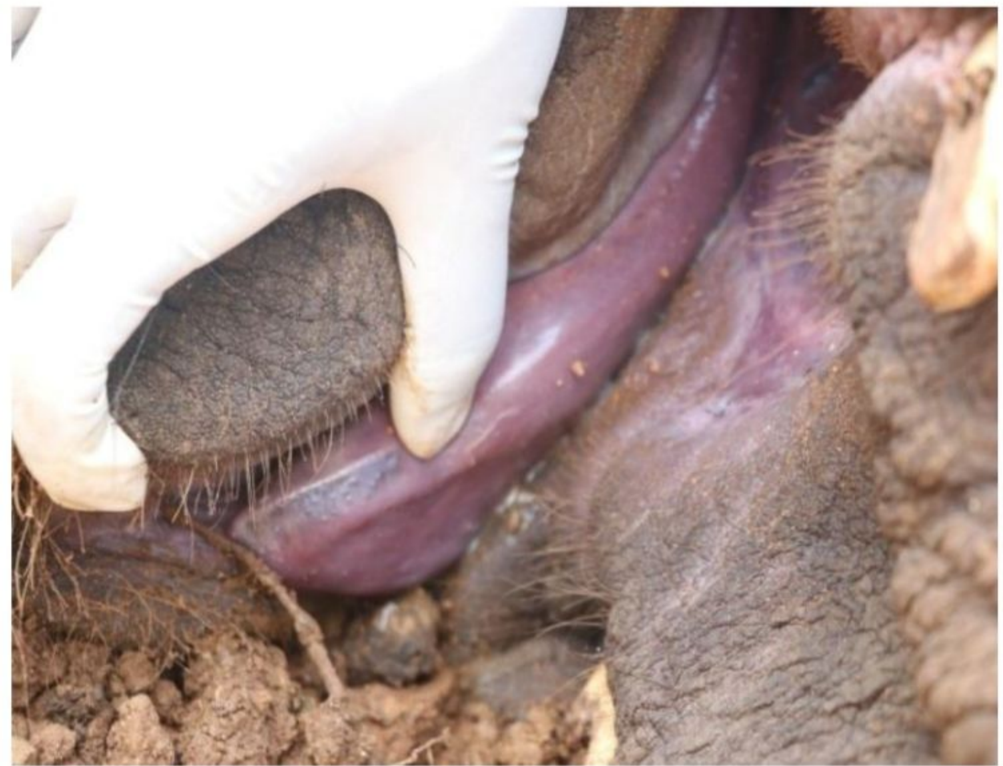
Fig.6. Cyanotic tongue (Blue discolouration of tongue)