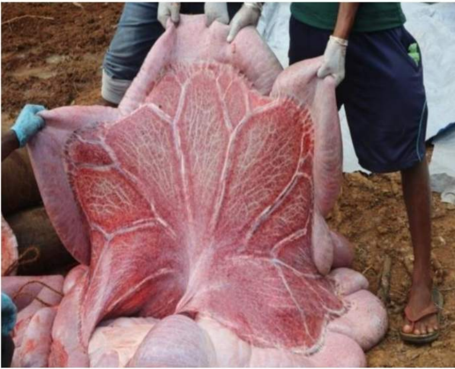
Fig. 9. Haemorrhage in mesentery